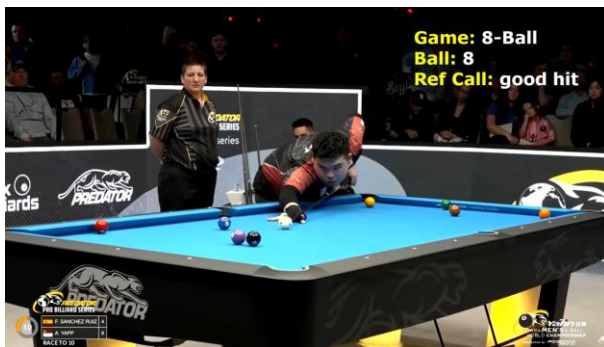
Yapp shot in 2026 8-Ball Championship

The video starts with four split-hit-call examples from recent pro tournament matches (see Image 1 ). Play the role of referee and decide if you agree with the calls when you watch the video. I hope you disagree with some or all of them, because each of the four calls was most definitely incorrect! Even top pro referees make mistakes at times. Hopefully, after watching the entire video, you will be convinced beyond a shred of doubt why the calls were bad.