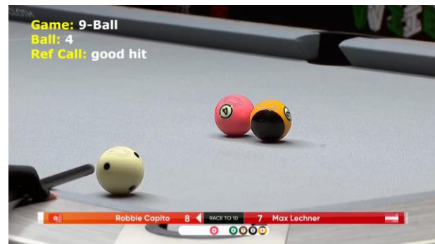
Capito shot in 2025 Hanoi Open