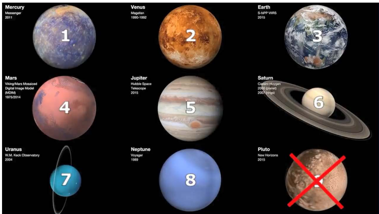
Image 4 9-planet ball-set inspiration

If you want to watch or listen to the podcast, it is available in online video NV J.97 , which a shortened (13:57) and illustrated video version with shot examples. The video includes images, illustrations, animations, and video demonstrations of many of the concepts being discussed. The full (52:15) unedited version of the video podcast is available at: