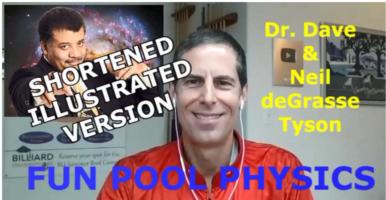
Image 1 Shortened/illustrated podcast video title screen